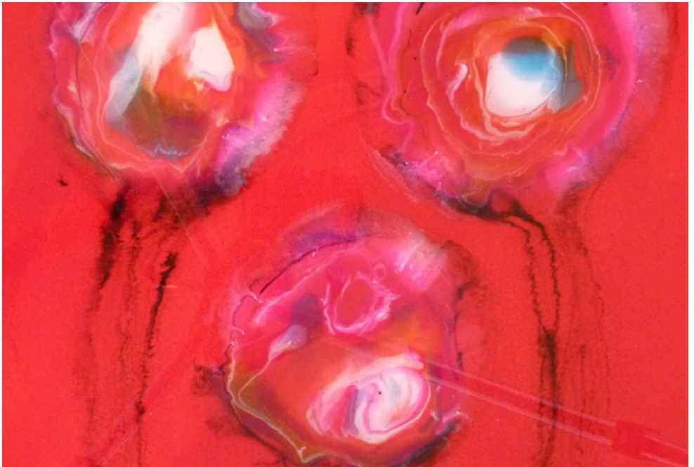
Below image: detail of Good neighbours