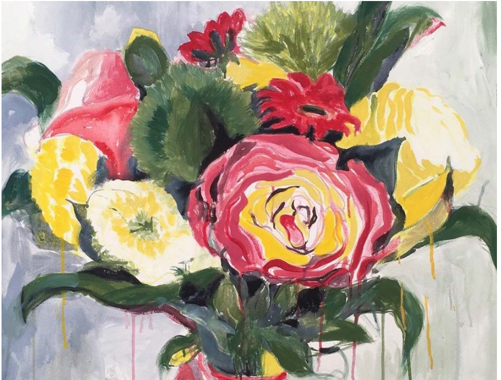
Image: detail of A Bunch of Love