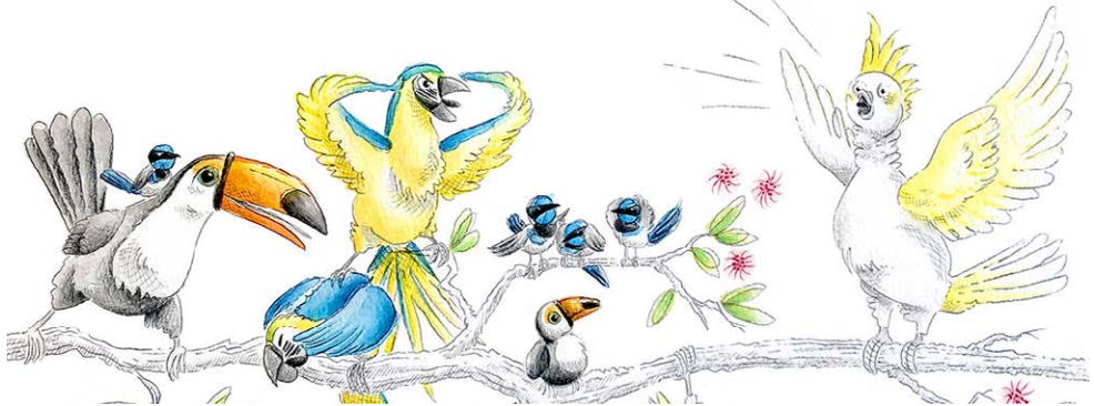
Back Cover Image: detail of 'Birds of a Feather' by Lauren Mullinder