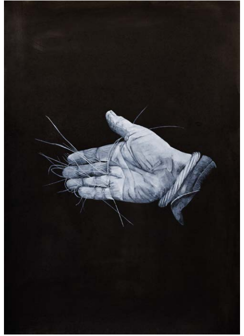
Image top left: Sophia, Year 6 student at Blair Athol North, Ink on Paper 2024