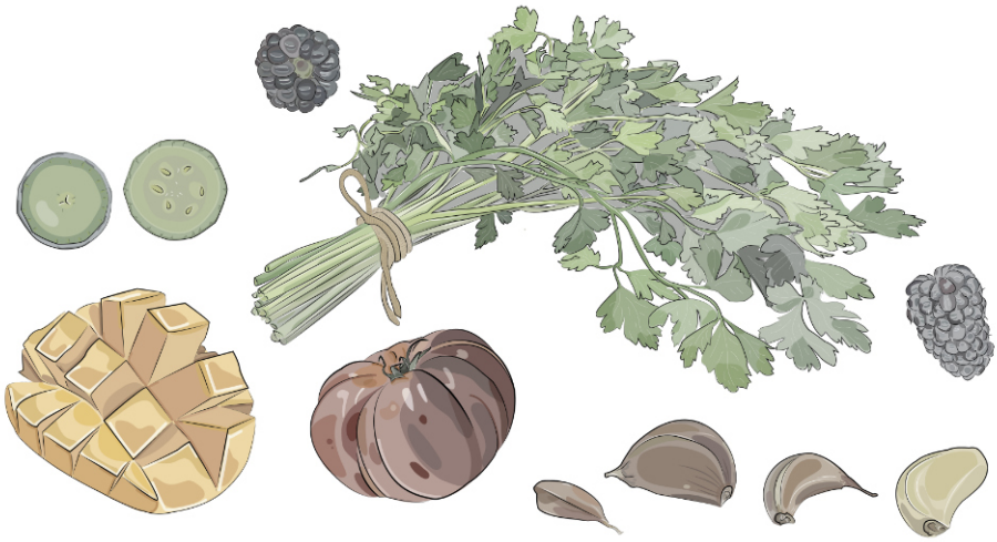
Detail of From Plate to Plate 2